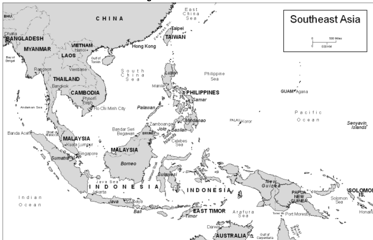
Figure 2. Southeast Asia