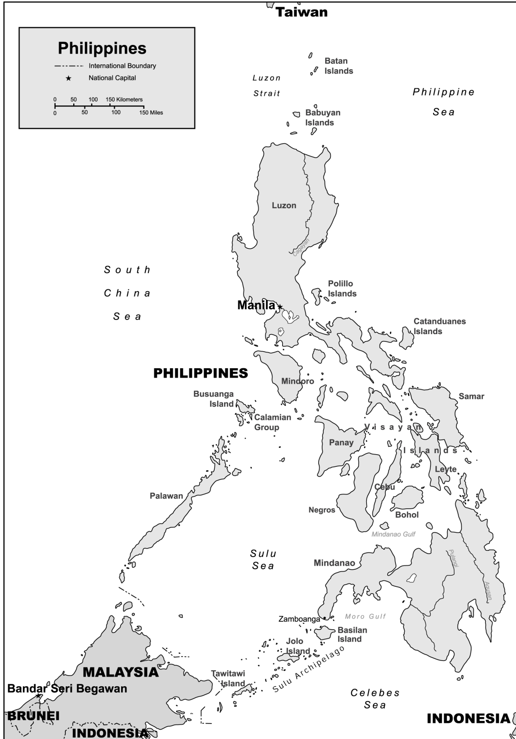
Figure 5. The Philippines