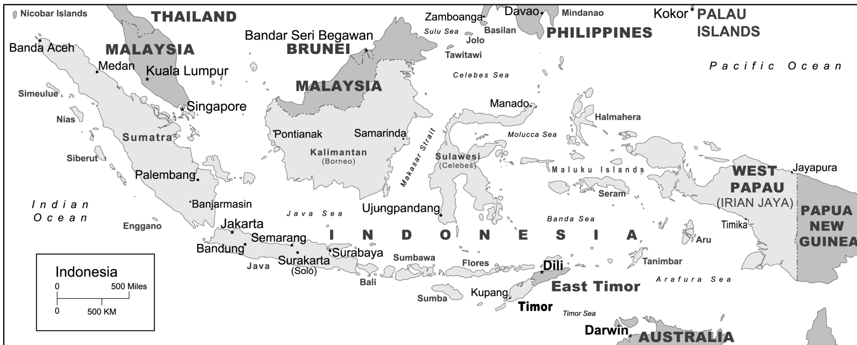
Figure 3. Indonesia