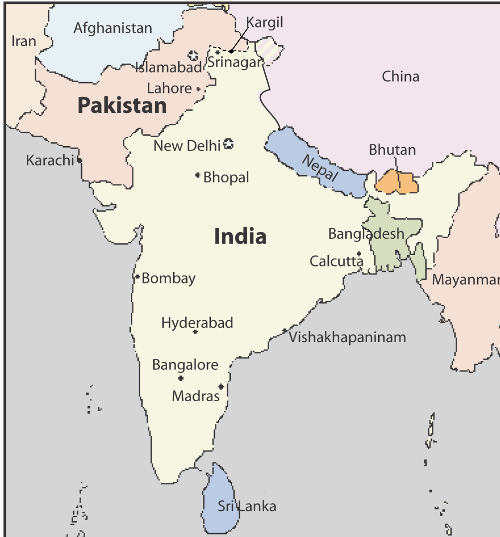
Figure 2. Map of South Asia

Adapted by CRS from Magellan Geographix. Boundary representations not authoritative.