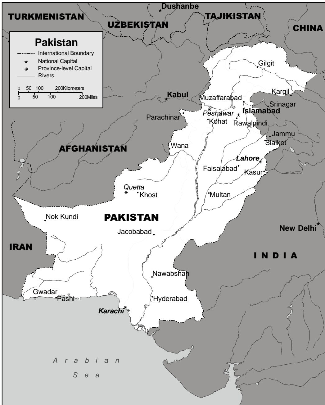
Figure 3. Map of Pakistan